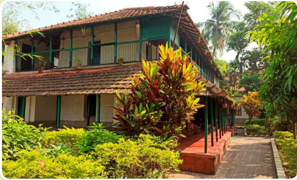
Sarat chandra chattopadhyay kuthi (Deulti, Panitras distance 7 K.M)