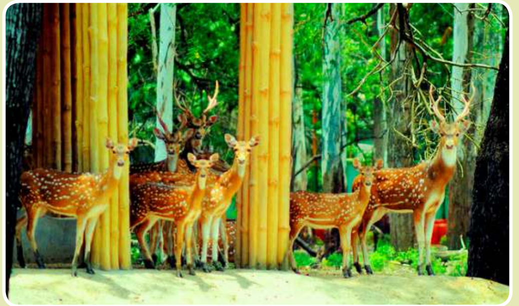
Garchumuk Deer Park (Howrah 26 K.M)