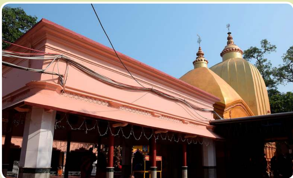
Bargabhima Temple (Tamluk, 30 K.M)