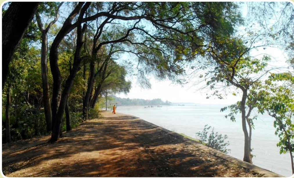
Gadiara (Howrah, 36 K.M)