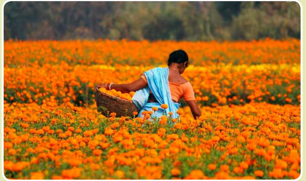
Khirai Flower Valley (Paschim Medinipur 35 K.M)